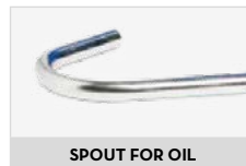
SPOUT FOR OIL