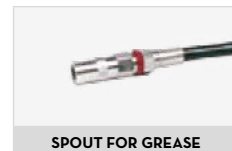
SPOUT FOR GREASE