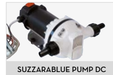
SUZZARABLU PUMP DC