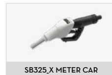
SB325_X METER CAR