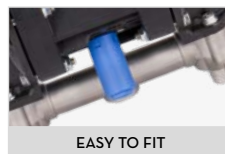
EASY TO FIT