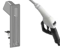
NOZZLE SWITCH WITH SB325_X