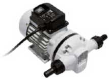
SUZZARABLU PUMP AC