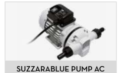
SUZZARBLUE PUMP AC