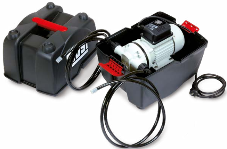
PIUSIBOX CAR SUCTION