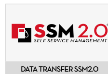
DATA TRANSFER SSM2.0