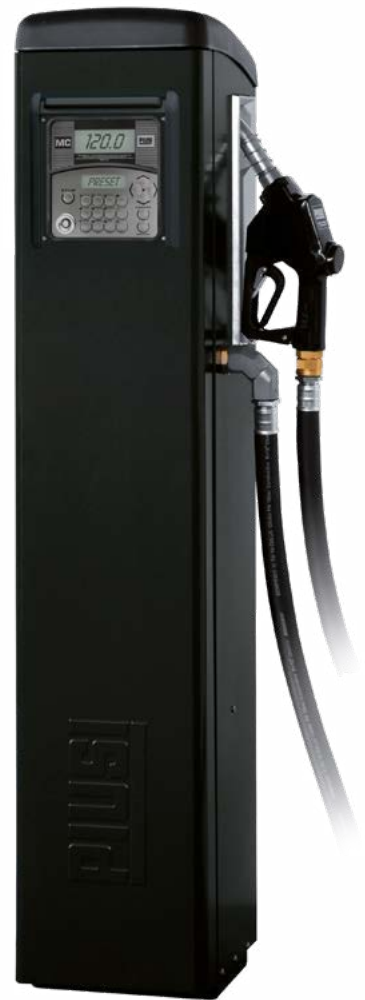
SELF SERVICE MC 2.0