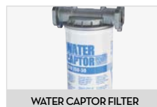
WATER CAPTOR FILTER