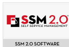
SSM 2.0 SOFTWARE