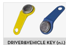
DRIVER&VEHICLE KEY (n.i.)